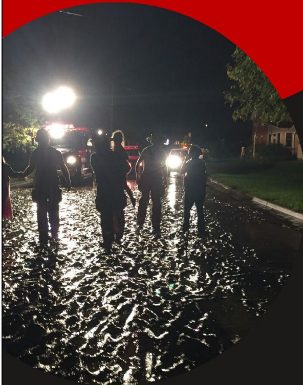
Photo from 2017 flooding in Cassville